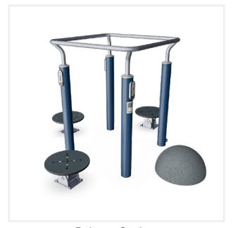
Balance Station FSW227