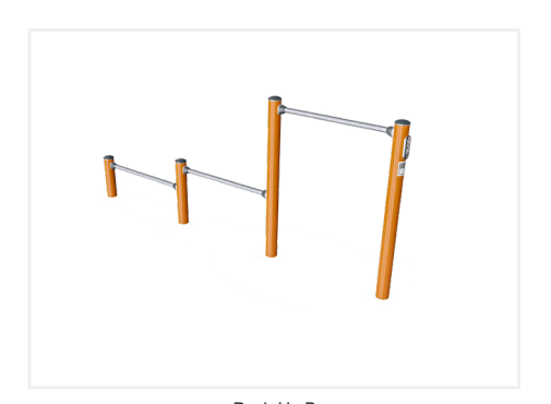
Push Up Bars