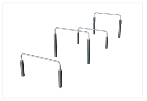
Over Under FSW214