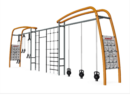
Magnetic Bells, Suspension Trainer & Multi Net Link FAZ201