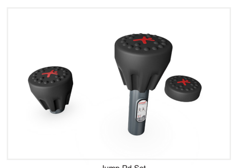
Jump Pd Set FSW221