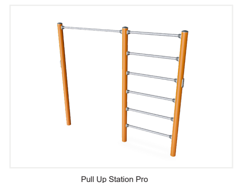
Pull Up Station Pro FSW208