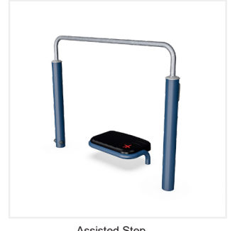
Assisted Step FSW222