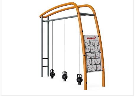
Magnetic Bells FAZ102