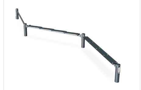
Balance Beam FSW215