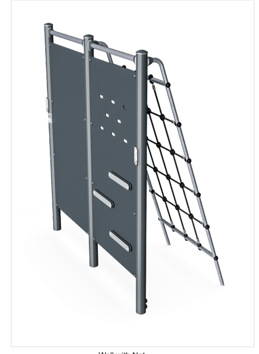
Wall with Net FSW216