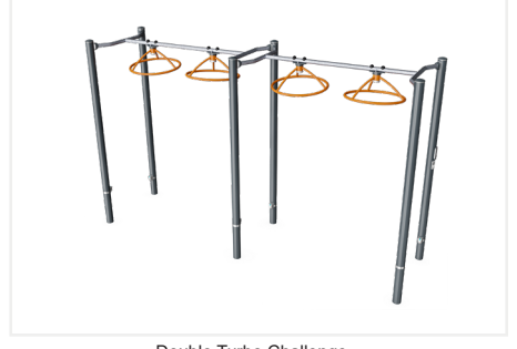
Double Turbo Challenge FSW21201