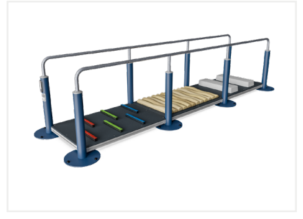
Surface Challenge 3 FSW224