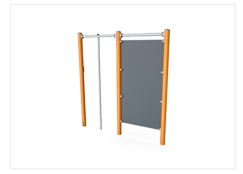
Human Flag Wall FSW220