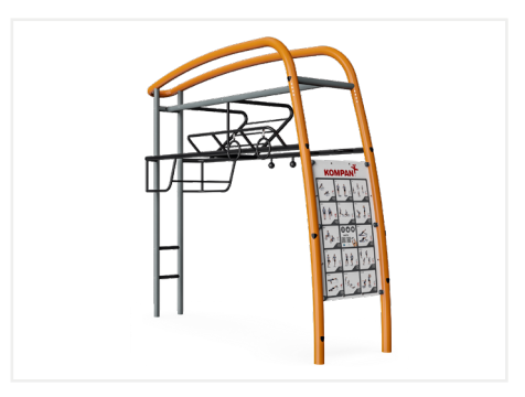
Pull Up Bars FAZ103