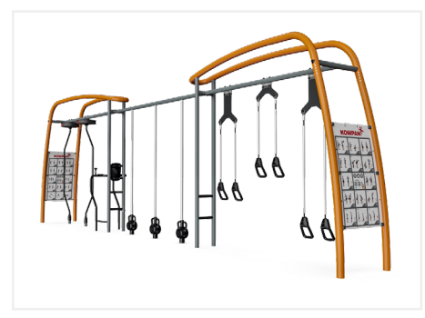
Magnetic Bells, Suspension Trainer & Core Twist Link FAZ204