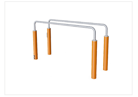
Parallel Bars FSW201