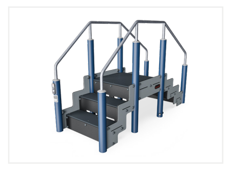
Double Stairs FSW230