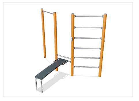
Combi 1 FSW101